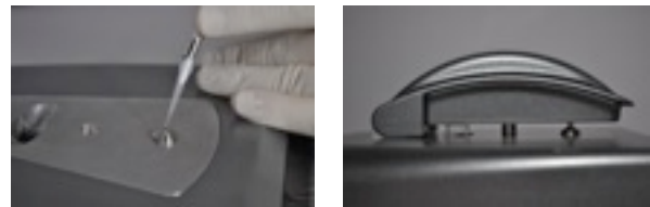
Figures 3a and 3b: Microvolume Mode

The DS-11+ model, with its built-in cuvette capability, extends the lower detection range for nucleic samples down to 0.4 ng/μL.