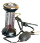
CO 2 Analyzer