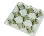
250ml x 9ea