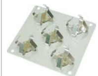
500ml x 5ea