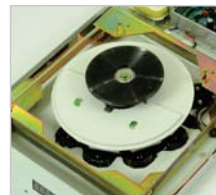
Plate type Brushless DC MOTOR provides Low Vibration, Low Dust & Low Noise.

Natural Air and Moisture Convection Air and Moisture in chamber are distributed naturally by 6 side heating, air circulation fan.