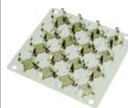
100ml x 16ea